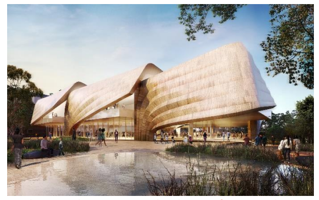
Tarrkarri North Terrace arrival with water feature and cantilevered galleries evoking a sense of welcome. Design credit Woods Bagot and Diller Scofidio + Renfro (DS+R).

Tarrkarri images are a commonly requested and used asset. All current images, with attached credits, can be found <u>here</u>.