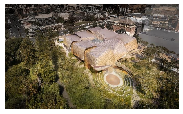
Tarrkarri aerial view, featuring an open-air amphitheatre, nestled amongst the immersive gardens. Design credit: Woods Bagot and Diller Scofidio + Renfro

DS+R in partnership with Woods Bagot, have designed Tarrkarri's unique building in close consultation with Tarrkarri's Aboriginal Reference Group, that links people to place: earth, land and sky.