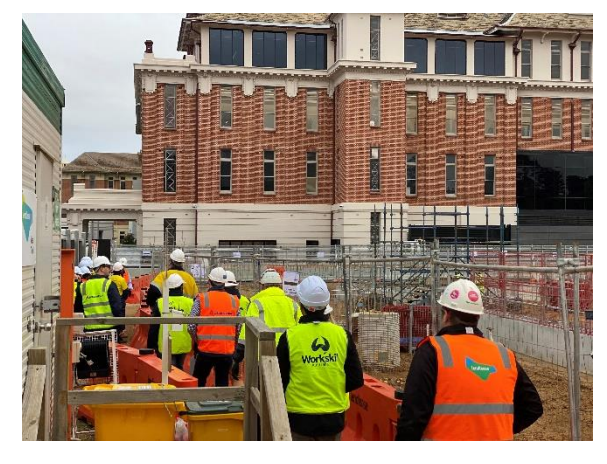
Industry Immersion Activity, June 2022

In June, the Project Team welcomed a group of Aboriginal participants and program stakeholders onsite, as part of an Industry Immersion Activity.