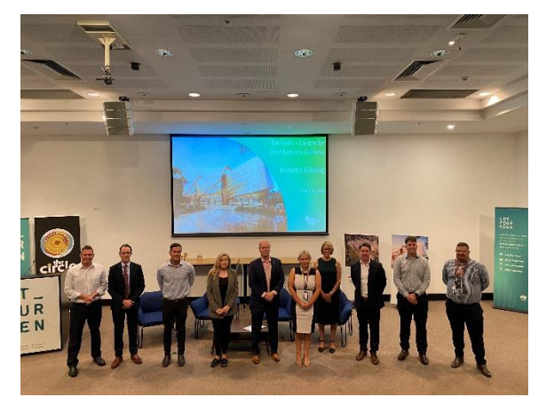
Tarrkarri Industry Briefing – speaker line up – 16 Feb 2022

Got a question relating to the trade packages? Please direct them to: tarrkarri@lendlease.com