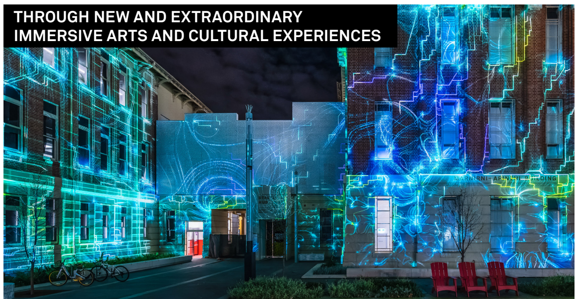
Emergent Horizons by Pixel Ninjas, Illuminate Adelaide 2021.

Lot Fourteen is a destination of wonder, with proximity to both deep time events and a visionary future.