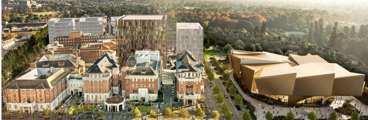
Lot Fourteen Master Plan Visualisation by Treehouse. Southern elevation.

This Arts and Culture Plan contributes to the South Australian Economic Statement and complements ‘A Place to Create’ Create SA’s 10-year plan cultural policy, the City of Adelaide Cultural Strategy 2017- 2023, and the Botanic Gardens and State Herbarium Strategic Plan 2023-2027.