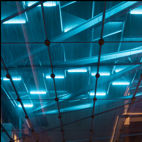
Bice Canopy at Lot Fourteen.

Lot Fourteen aims to follow a best practice Percentage for Art model, where all new developments at Lot Fourteen commit funds to public art at Lot Fourteen. The implementation of funds can be negotiated between developers and Lot Fourteen or handed over to Lot Fourteen to contribute to more significant projects.