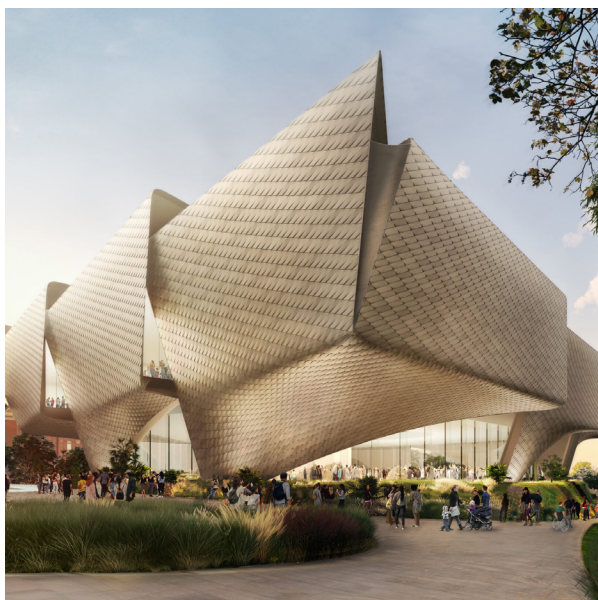
Visualisation of Tarrkarri - Centre for First Nations Culture.

The great ambition for arts and culture at Lot Fourteen will be realised through a combination of the following strategies: