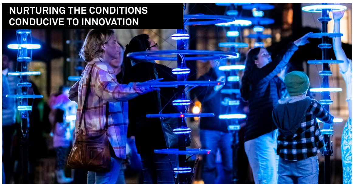
Halo by Illumaphonium as part of Illuminate Adelaide's City Lights trail at Lot Fourteen.