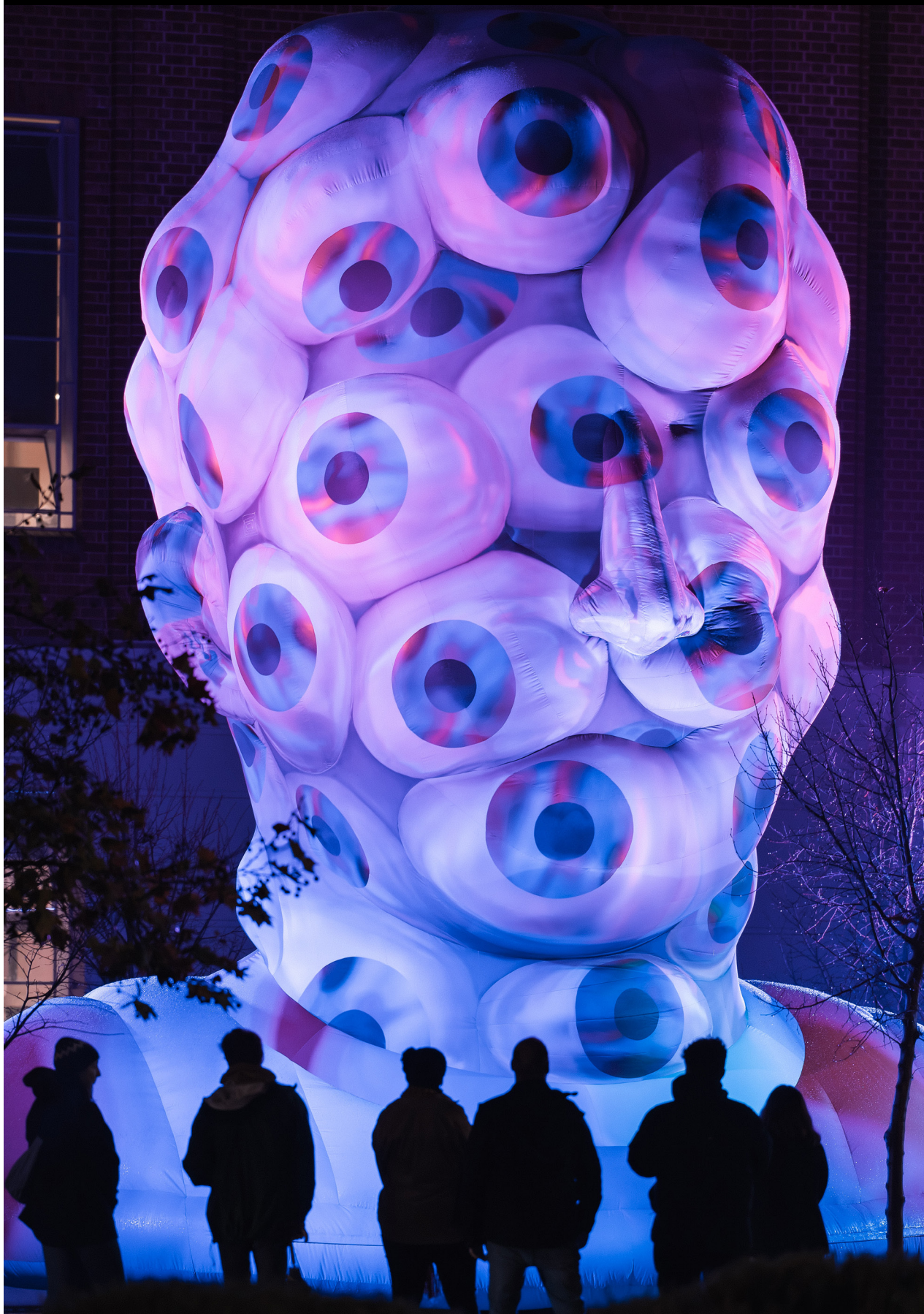
The Eyes by Cool Shirt, Illuminate Adelaide 2023, Lot Fourteen.