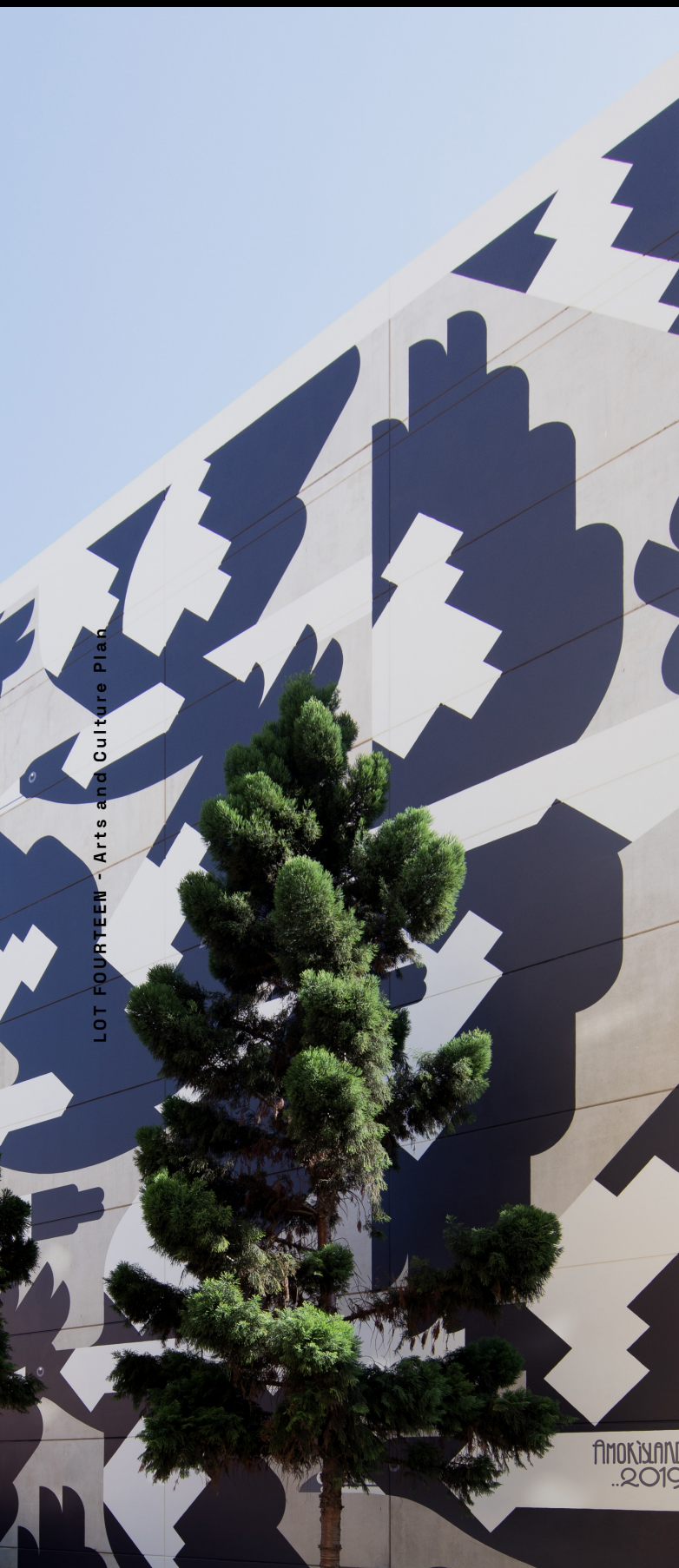
Lot Fourteen artwork One: ALL that we can see by Sundari Carmody.