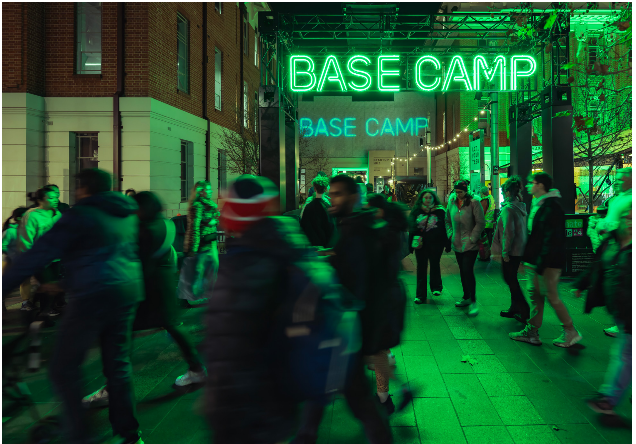
Lot Fourteen hosts festivalgoers at Base Camp, as part of Illuminate Adelaide.

— Peter Malinauskas MP, 2024, Premier of South Australia.