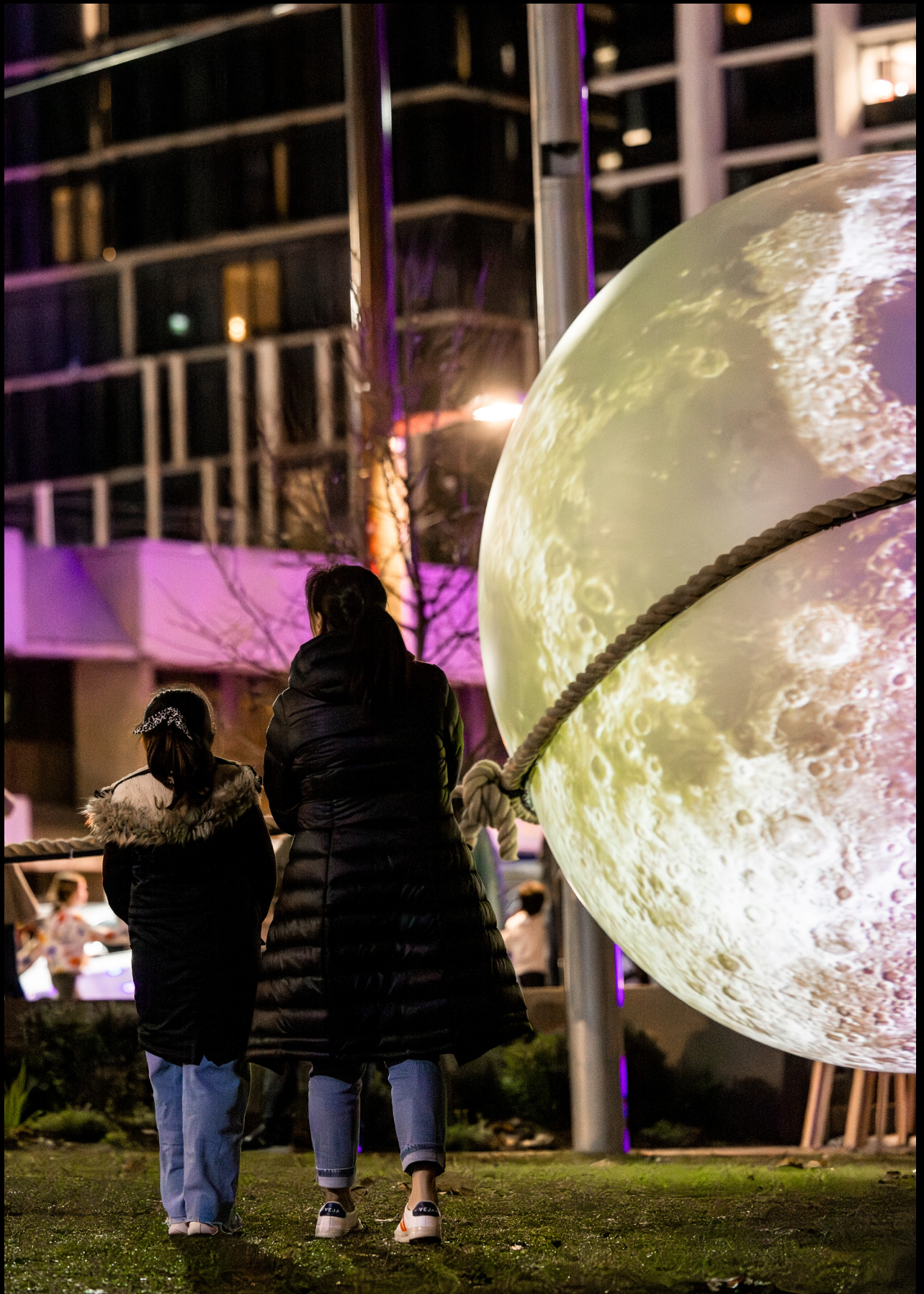
Ursula Lassos the Moon by Studio Vertigo, Illuminate Adelaide 2023, Lot Fourteen.