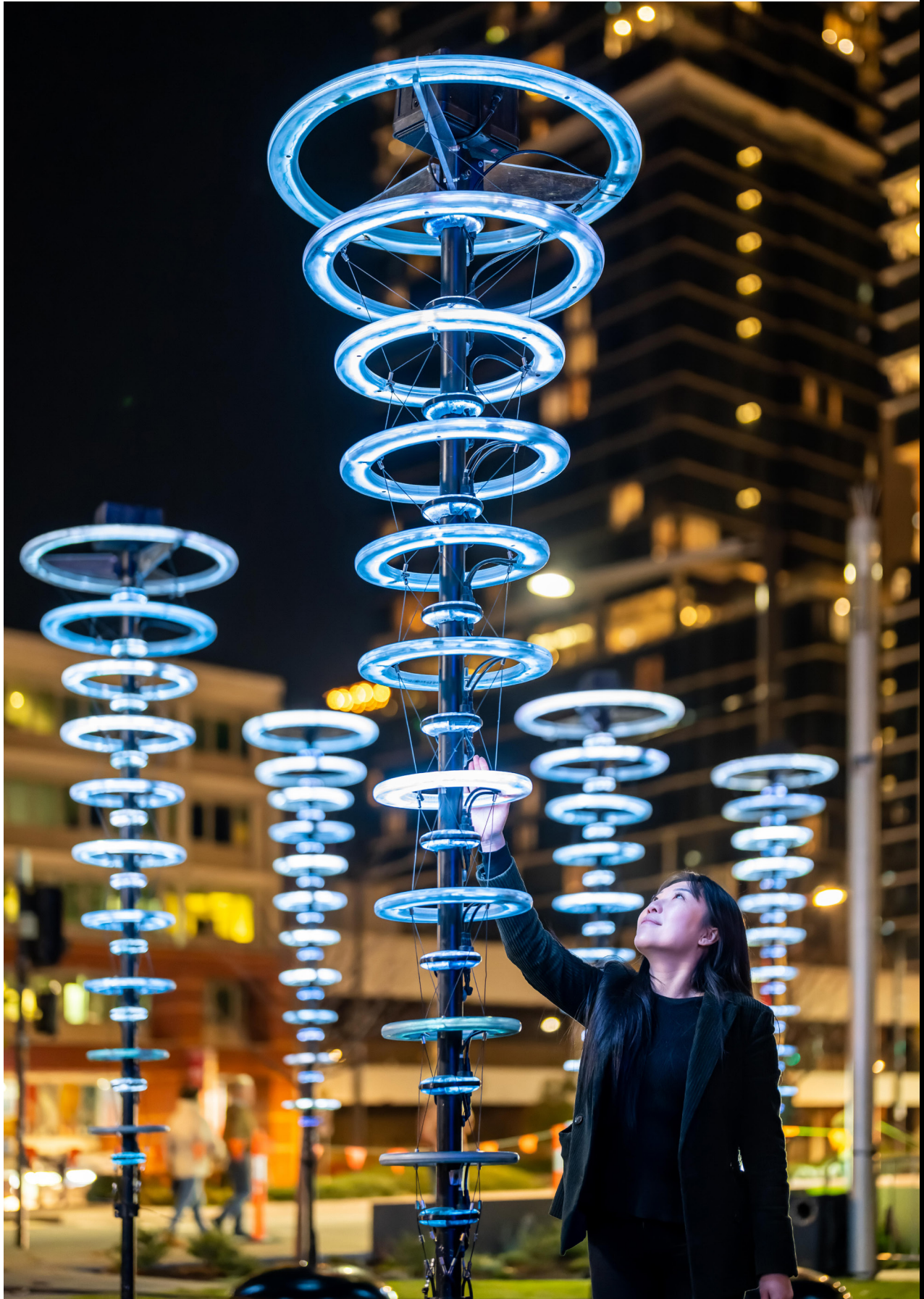
Halo by Illumaphonium, Illuminate Adelaide 2022, Lot Fourteen.